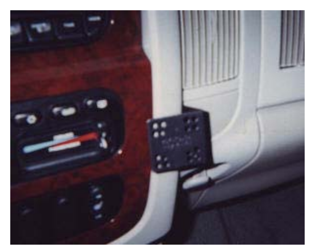
Finished Install Picture